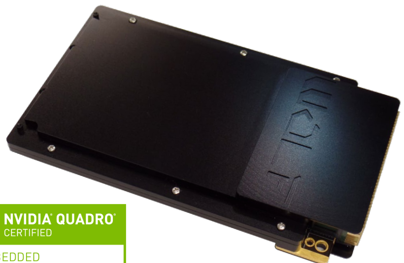
WOLF-1110 Chip-Down VPX Module

The WOLF Frame Grabber eXtreme (FGX) is the engine that provides the board with conversion of video data from one standard to another, with a wide array of video input and output options for both cutting-edge digital I/O and legacy analog I/O. The FGX has direct memory access (DMA) to the Quadro Pascal's GPU memory for GPU processing and complex analysis. By including both the versatile FGX and a high performance Quadro Pascal GPU on one board WOLF's I/O and processing solution avoids the SBC data rebroadcast traffic jams that commonly occur with a 2-board solution.